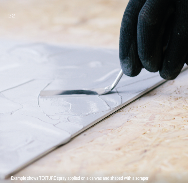
Example shows TEXTURE spray applied on a canvas and shaped with a scraper