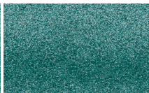
EMC6250 Caribbean TNR: 448737