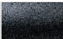
EMC9000 Black TNR: 448768