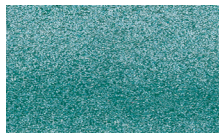
EMC6210 Tennessee TNR: 448720