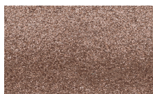
EMC2010 Champagner TNR: 448690