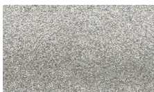
EMC7010 Silver TNR: 448744