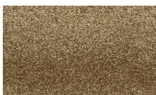
EMC1050 Gold TNR: 448683