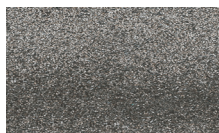
EMC7060 Graphit TNR: 448751