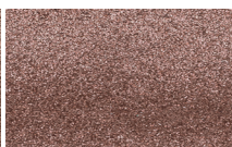
EMC2050 Copper TNR: 448706