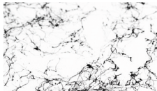
EM9000 Black TNR: 415357