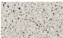
EG7000 Light Grey TNR: 415388