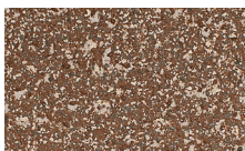
EG8000 Brown TNR: 415418